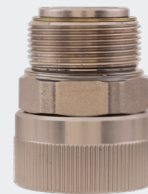
Straight Swivel 1.5" (L-FS38)