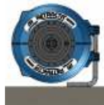
Fig.3 BB100 - Floor/Bench

F) BB100 – Remove the upper collar by loosening the screw, mount the reel onto the bracket, refit the collar and secure with the screw.