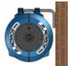
Fig.4 BB100 - High Wall

G) Use the 8mm screw provided to secure the pin on the BU100 bracket and prevent accidental removal. A padlock (not supplied) can be fitted for additional security on both brackets.