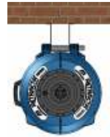
Fig.2 BU100 - Overhead

F) BB100 – Remove the upper collar by loosening the screw, mount the reel onto the bracket, refit the collar and secure with the screw.