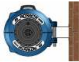
Fig.1 BU100 - Wall

E) BU100 – remove the pin from the bracket, mount the reel onto the bracket and insert the pin to secure the reel.