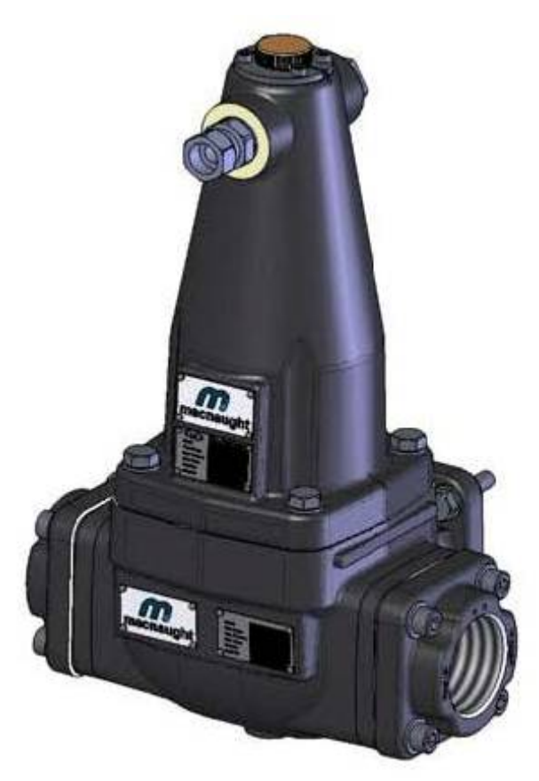
FIGURE 5/6B/211 - 2

(a) Macnaught Model MAE21-CA1 Gas Extractor With Integral Filter/Strainer