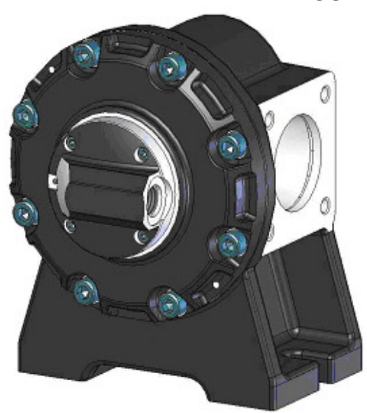
FIGURE 5/6B/211 - 3

(a) WM (or M) Series Flowmeter With Base (Foot) Mount Body