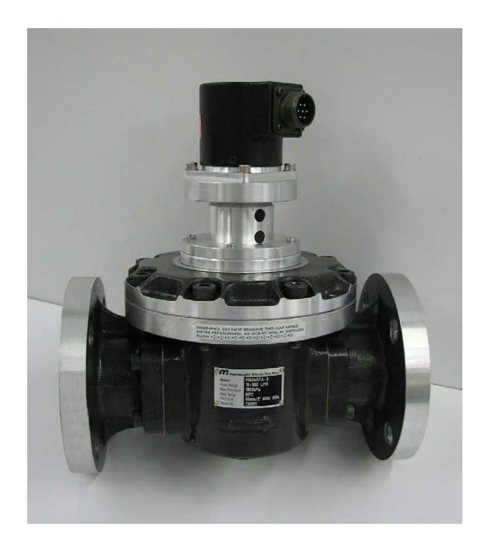
FIGURE 5/6B/211 - 4

Macnaught Model M50 Flowmeter with a Hontko HPN-6A Series Rotary Encoder Pulser