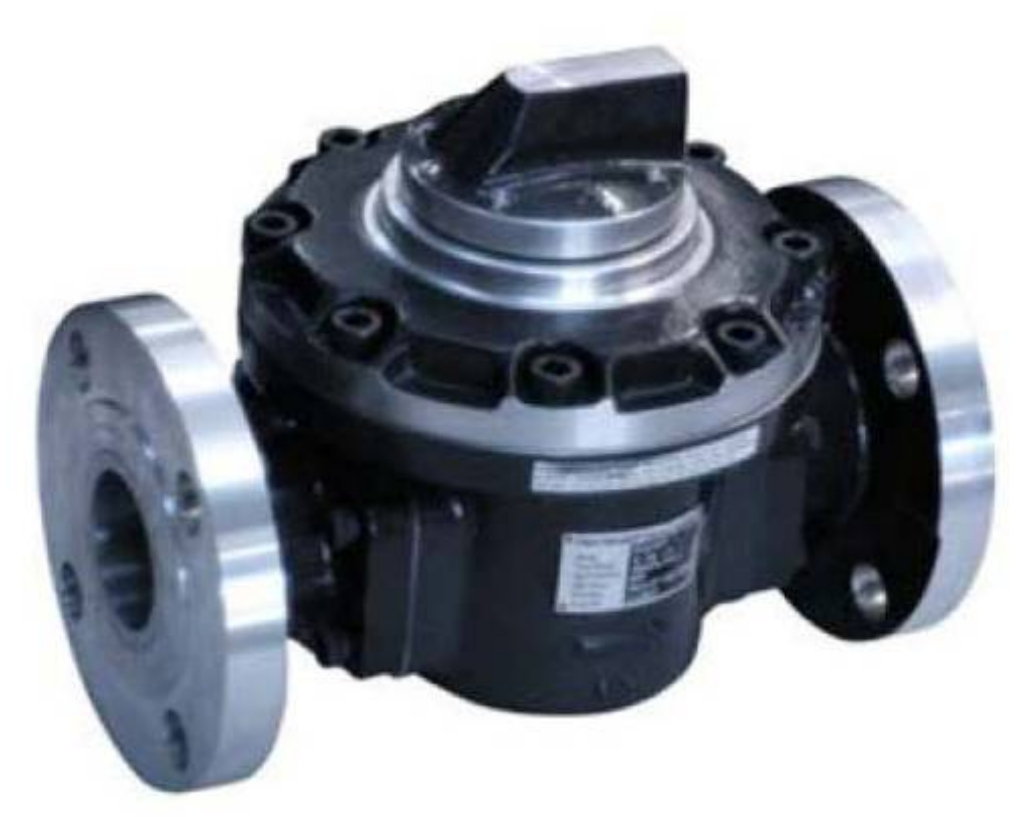
(b) Macnaught Model WM50ARP-3E Flowmeter With Integral Pulser

(a) Macnaught Model MAE21-CA1 Gas Extractor With Integral Filter/Strainer