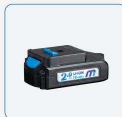
BPB-20AH 18V 2.0Ah Li-ion battery