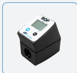
IM012EB-01 BOP inline meter