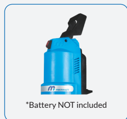
BP20-PH Power Head*