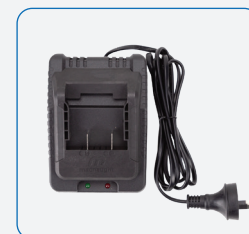
BPC-A BOP Charger