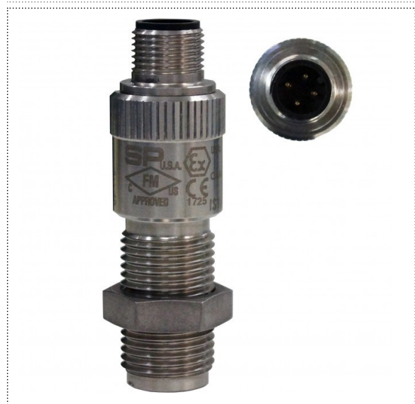
INTRINSICALLY SAFE (EX IA)