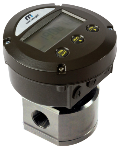
ERA Digital Register